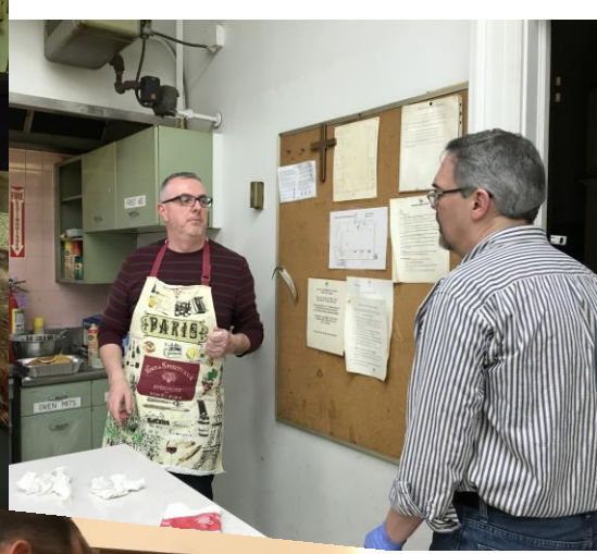
Shrove Tuesday, pancake baseball, games, and behind the scenes. Ash Wednesday with our Nursery School. Last Year's Easter Egg Hunt (top).