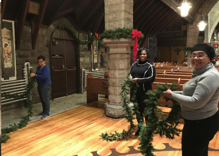
Greening of the Church on December 16, getting ready for the Pageant, and scenes from our Pageant on December 17.